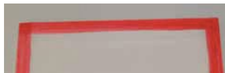
SAATI Pre-Stretched Screens are made with SB5 plus glue for superior chemical resistance