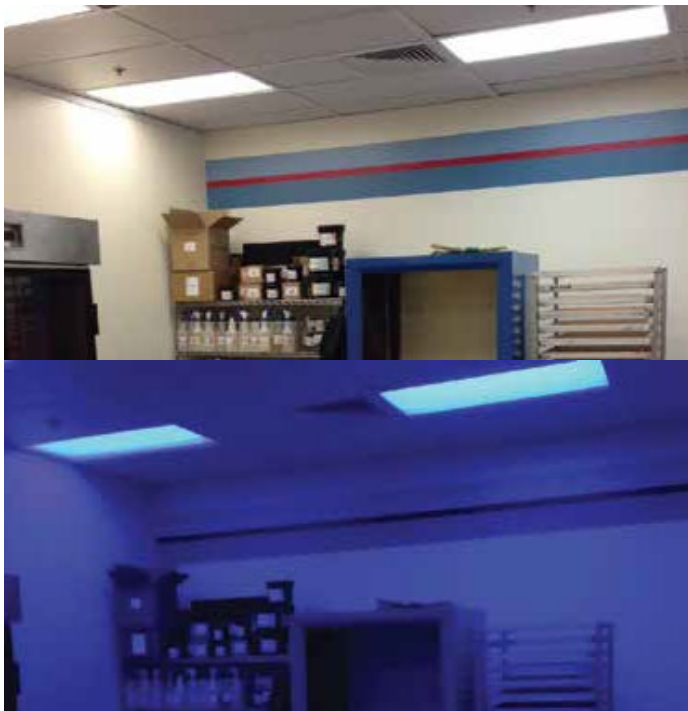
Top: Visible light in screen room with standard fluorescent tube lighting Bottom: Prevalence of wavelengths that expose photo emulsion