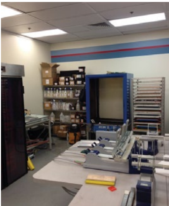
Left: Standard fluorescent tube light in screen room