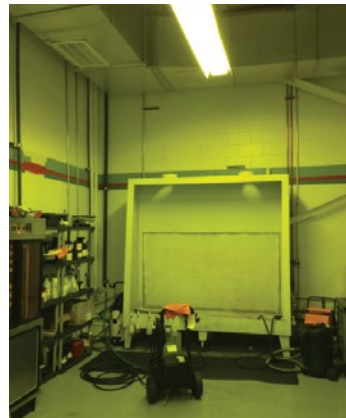
Left: Yellow light washout lab